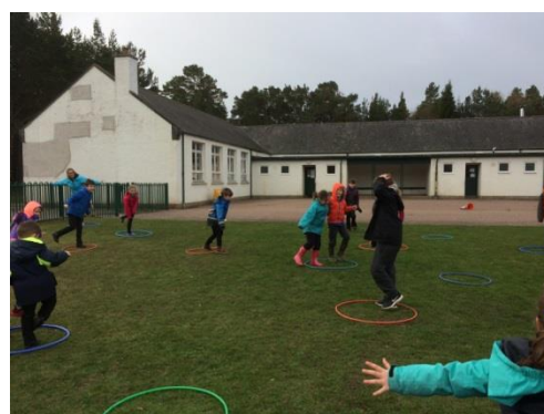
Fun, active and inclusive play